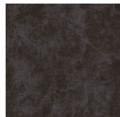
DARK GREY YL30PZ00PE 300X300 mm