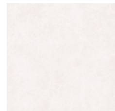
WHITE YL30PZ01PE 300X300 mm