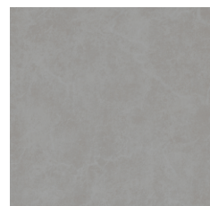
GREY YL30PZ04PE 300X300 mm