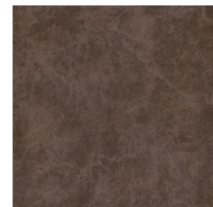
BROWN YL30PZ03PE 300X300 mm